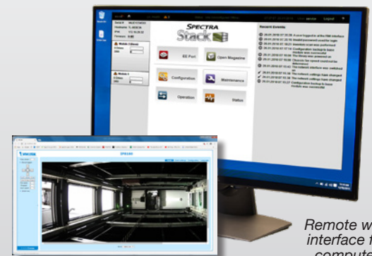
Remote web interface for computer